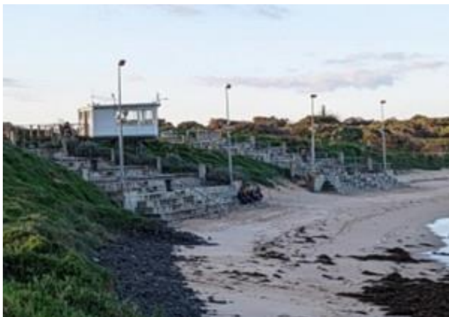
General Viewing Area

Underground Viewing – This is an underground area where you can watch the Little Penguins waddle right past the window, some might even come up to the glass to say g'day. This area has ramp access and a nightly stand talk by rangers is provided.