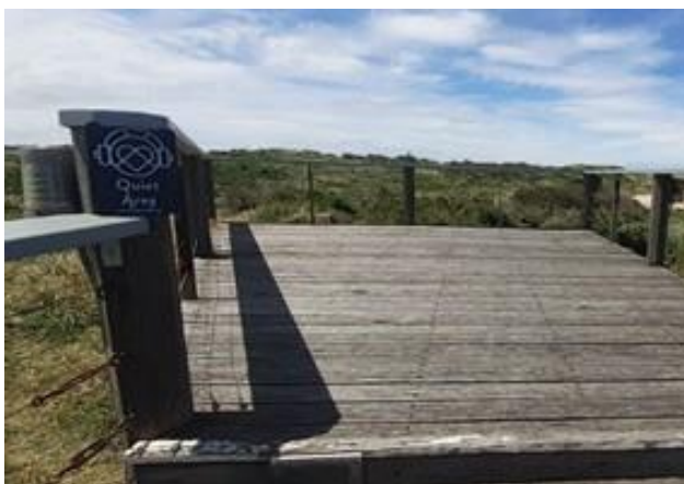
Quiet Zone Sign

Some areas of the Penguin Parade can get a little loud. There are Quiet Zones and Headphone Zones around the viewing areas. They are clearly marked, but you can also ask a staff member for directions.