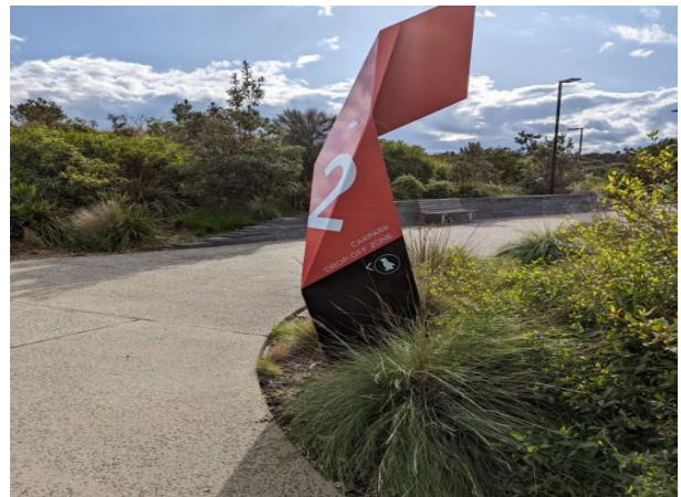
Path with gentle gradient to main entrance

The designated accessible parking spaces are approximately 200 metres from the entrance. The path to the entrance is generally flat with one section that is a gentle rise. Gradients throughout the rest of the area are generally flat. There are some steep sections to access the penguin viewing area.