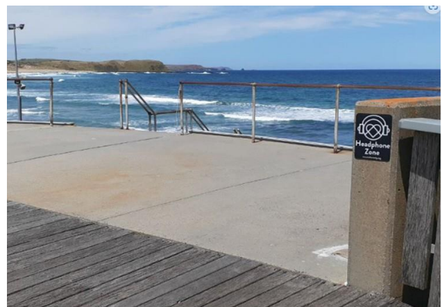
Headphone Zone Sign