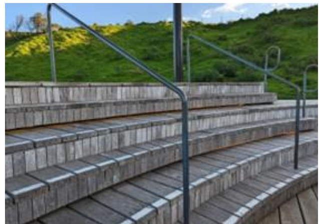
Seating in the General Viewing Area

Some areas of the Penguin Parade can get a little loud. There are Quiet Zones and Headphone Zones around the viewing areas. They are clearly marked, but you can also ask a staff member for directions.