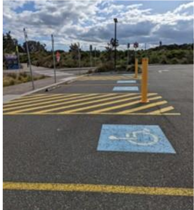
Four Designated Accessible Parking Bays

Tours and Transport: Contact a Visitor Information Centre in Melbourne or on Phillip Island for tours and transport options.