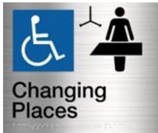
Changing Places Sign

There are toilets located midway to the penguin viewing area, although they are not accessible.