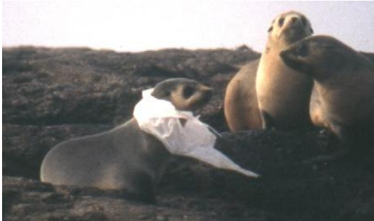
Plastic Shopping Bag

Finish with a message telling people what they can do to prevent this from happening again!