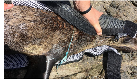
Balloon and Ribbon